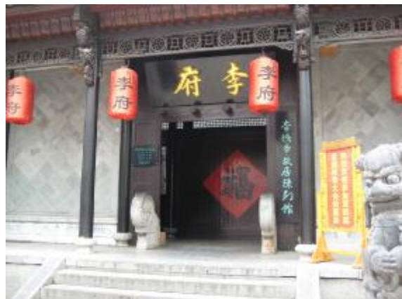
Former Residence of Li Hongzhang